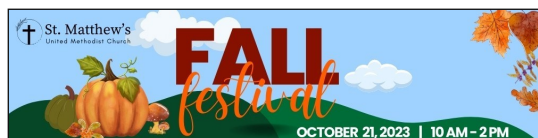
Exhibit your products, services or programs at our upcoming Fall Festival